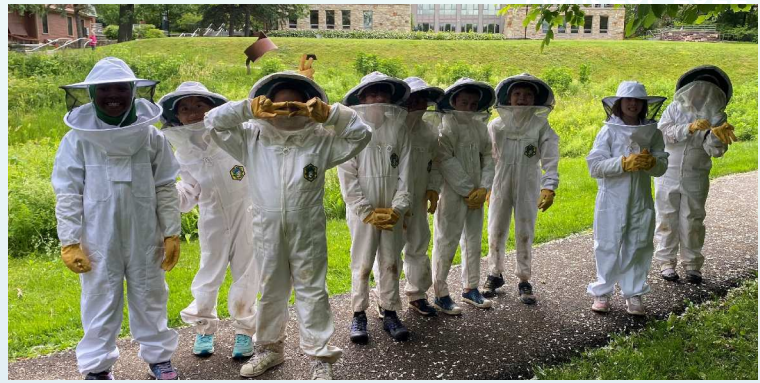
2nd Graders Visit Apiary