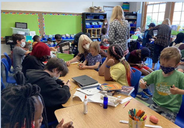
EES Fun Day