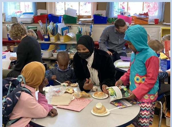
CLIF Family Breakfast