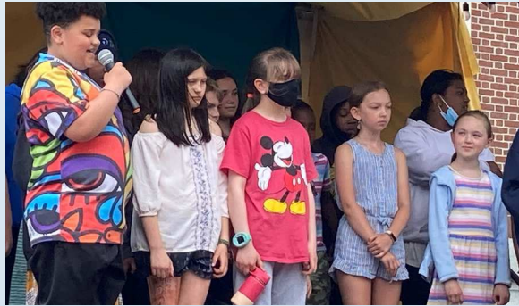
EES Chorus Performing at Jazz Fest!