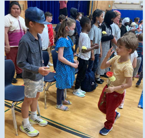
5th Grade Flower Ceremony