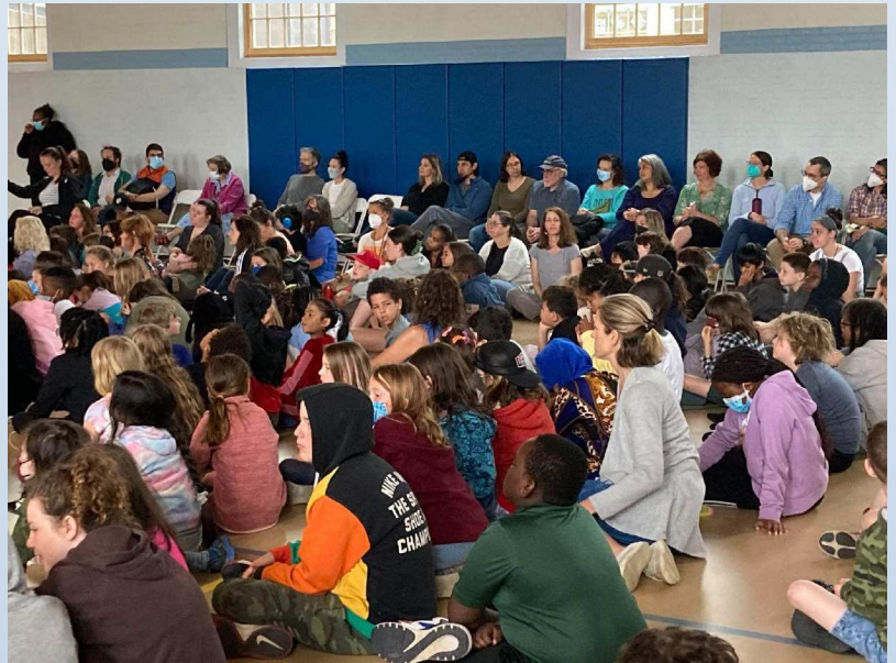
Watercress reading by Jason Chin