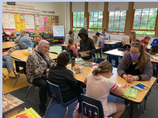
Parents reading with their children