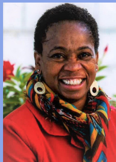
“Gratitude is not only the greatest of virtues, but the parent of all the others” – Marcus Tullius Cicero

I hope that everyone had a restful Thanksgiving break. Thanksgiving is a great time to pause and remember all the things we are “grateful” for, that we often take for granted. I remain incredibly grateful for the opportunity to work with such an outstanding faculty, our community and most importantly our students.